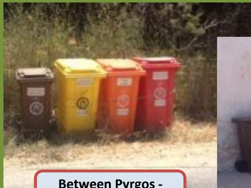
Between Pyrgos - Panormos